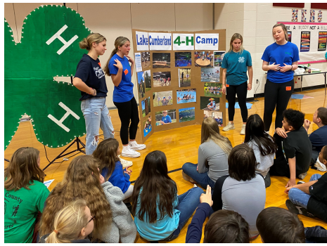
Teen Leadership planned and conducted at 4-H camp kick-off promotion for over 600 youth at Adair County Elementary school