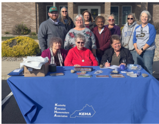
Volunteers during KEHA Week

Happy Thanksgiving! As we enter this season of gratitude, we want to express how thankful we are for our incredible Homemaker community and the wonderful connections we share. November brings a full schedule of events to celebrate, learn, and craft together, and we hope you'll join us for the fun! This month's highlights include: