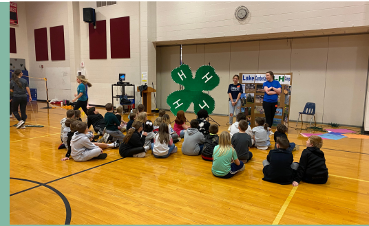
4-H Camp Kickoff