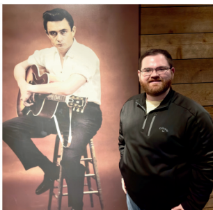
Dylan visited the Johnny Cash Museum in Nashville