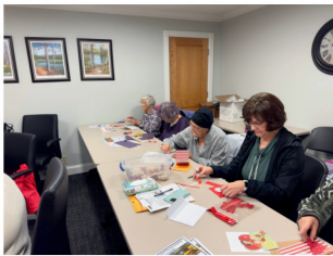
Attendees at Creative Ideas for Healthy Minds made Valentine's Day cards