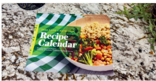
FREE 2024 Recipe Calendars are now available