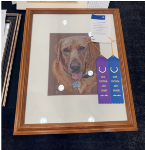
Last year's 1st place state Cultural Arts winner

Additionally, the Homemakers are collecting extra-large twin-sized quilts for the Camp for Courageous Kids, a summer camp for children with special needs. Quilt donations, which can be handmade, machine-made, or purchased, are accepted until May 1st at the Extension Office.