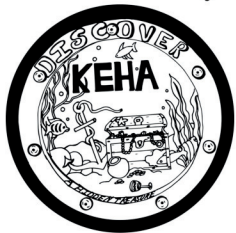
This year's KEHA State Meeting Logo