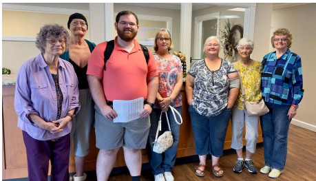
Bliss Club's Summer trip to Greensburg's cafe & museum

Yard sales, consignment shops, and bargain hunting have increased in popularity in recent years. Our area is home to several prominent yard sale events throughout the year that benefit the local economy. In order to address this growing trend, on August 11th at 10:00 a.m. CST, the Extension Office will host a Basic Guide to Yard Sales and Consignment Shops . The class will cover the many considerations needed to host a successful yard sale, what to know when attending a yard sale, and important differences between resale and consignment shops. Please RSVP to the Extension Office by calling (270) 384-2317.